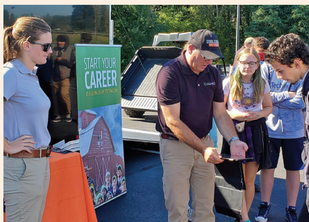
TVHS students discover how satellites and GIS can support high-tech farming in a Career Exploration opportunity from SUNY Cobleskill.

Student-run clubs and organizations provide opportunities for students to develop and share talents. FIRST Robotics, yearbook, Student Government, and an annual play are just some of the activities that students facilitate. Tech Valley also holds an annual prom open to TVHS students in all grades.