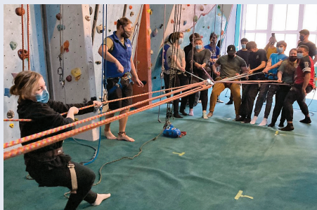
11th grade Physics students learn about pulleys and levers at Albany's Indoor Rockgym (AIR).

Students aren't just assessed on their understanding of academic content, but on their ability to successfully apply that content when solving authentic problems. This expands student learning by preparing them with work habits and character traits needed to succeed in whatever the future holds for them.