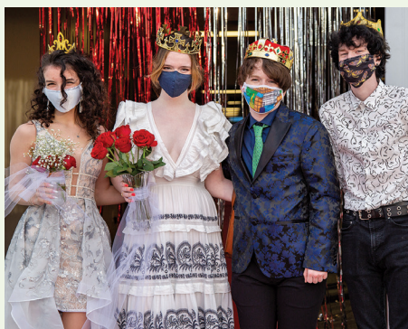
Tech Valley High students can participate in school activities both at TVHS and their home districts.

Students routinely present their work and explain the process to participants, including educators and members of the professional business community.