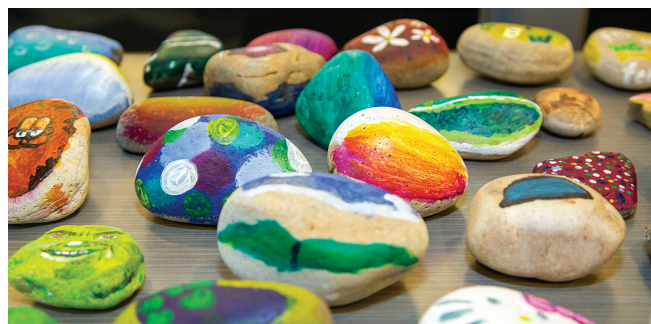
Students participated in the Albany Rock Project to invite engagement in outdoor spaces throughout the city.

Students complete 100 hours of community service over their four years at TVHS. This program component allows students to build capacity as local and global citizens.