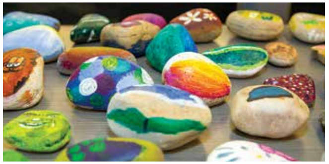
Students participated in the Albany Rock Project to invite engagement in outdoor spaces throughout the city.

Students complete 100 hours of community service over their four years at TVHS. This program component allows students to build capacity as local and global citizens.