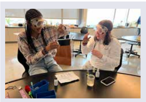
Students prepare for research at the Hudson River

Students aren't just assessed on their understanding of academic content, but on their ability to successfully apply that content when solving authentic problems. This expands student learning by preparing them with work habits and character traits needed to succeed in whatever the future holds for them.