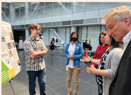
Students showcase their best work for business partners at our annual Expo.

Student-run clubs and organizations provide opportunities for students to develop and share talents. FIRST Robotics, yearbook, Student Government, and an annual play are just some of the activities that students facilitate. Tech Valley also holds an annual prom open to TVHS students in all grades.