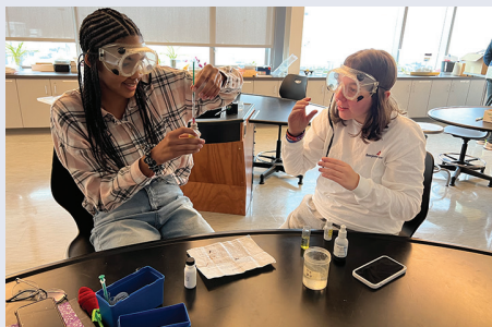
Students prepare for research at the Hudson River.

Students aren't just assessed on their understanding of academic content, but on their ability to successfully apply that content when solving authentic problems. This expands student learning by preparing them with work habits and character traits needed to succeed in whatever the future holds for them.