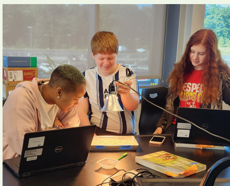
Students work in the science lab analyzing abiotic factors.

Students routinely present their work and explain the process to participants, including educators and members of the professional business community.